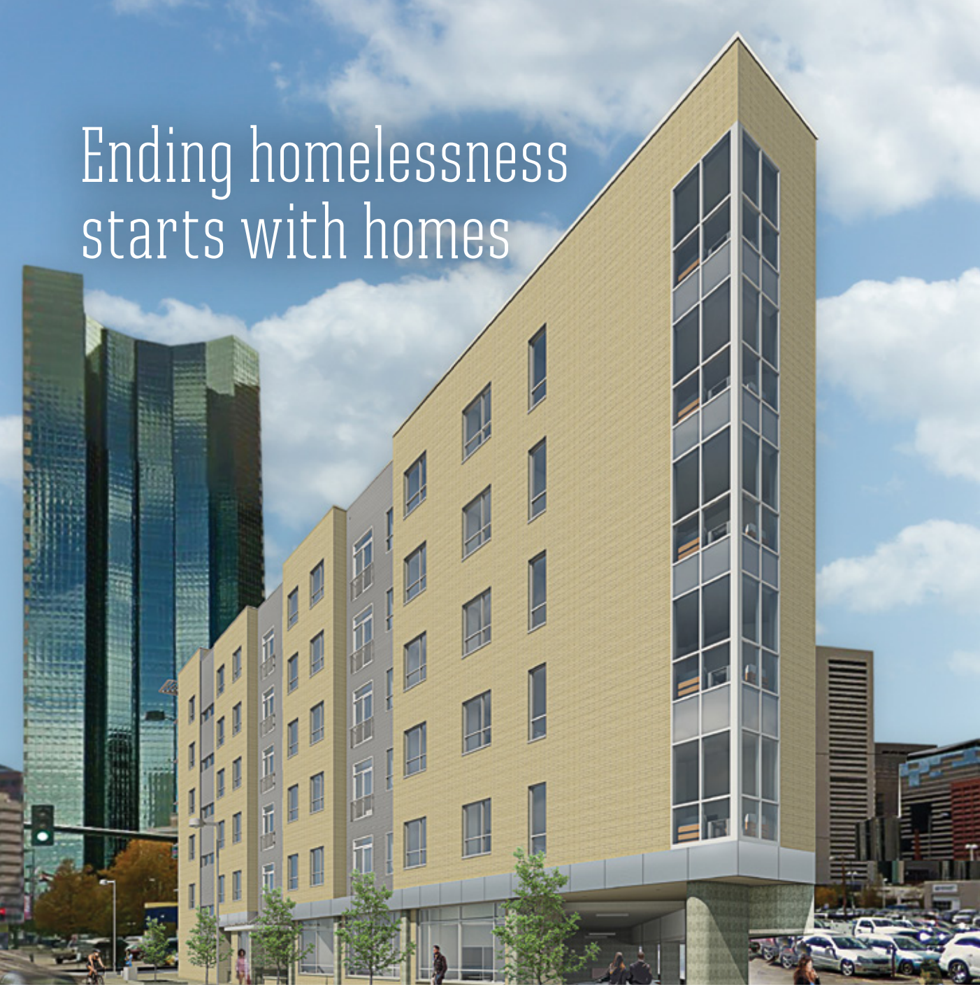
ABOVE Architect's rendering of the Renaissance Downtown Lofts, which broke ground in 2016.

Throughout 2016, metro Denver experienced historic levels of residential development, yet low-income individuals and families found themselves in an increasingly hostile environment of escalating rents and dwindling supply of affordable housing.